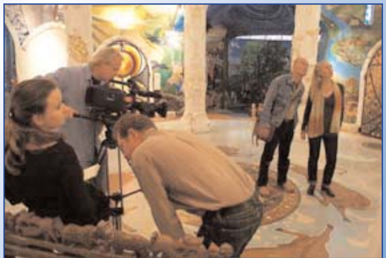
Scenes in the Temples of Humankind