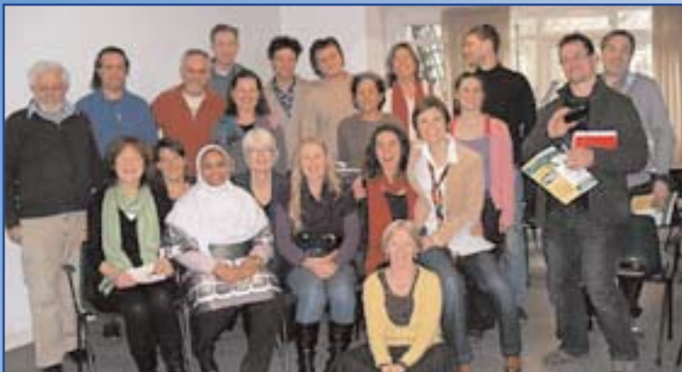
The Learning Partnership team at the Quality Center in Utrecht, Netherlands