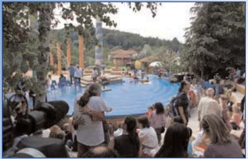
A gathering in the Damjil amphitheatre