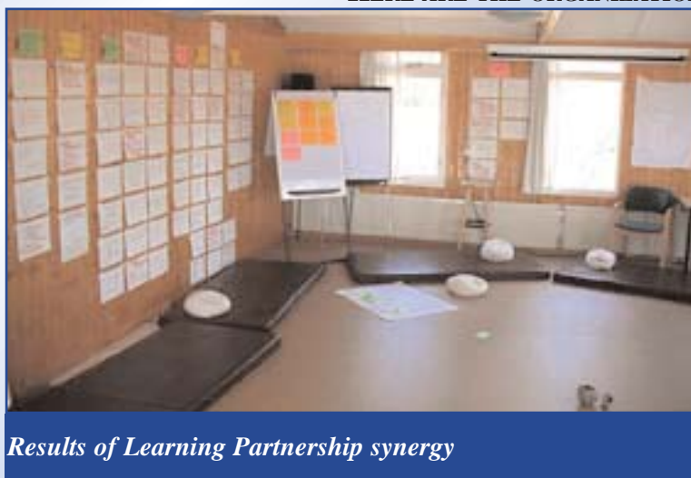
Results of Learning Partnership synergy