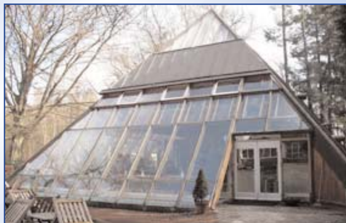
The community of Venwoude in Utrecht

In this edition, read about the second Learning Partnership meeting in Utrecht, Netherlands. This collaboration of diverse organizations, including