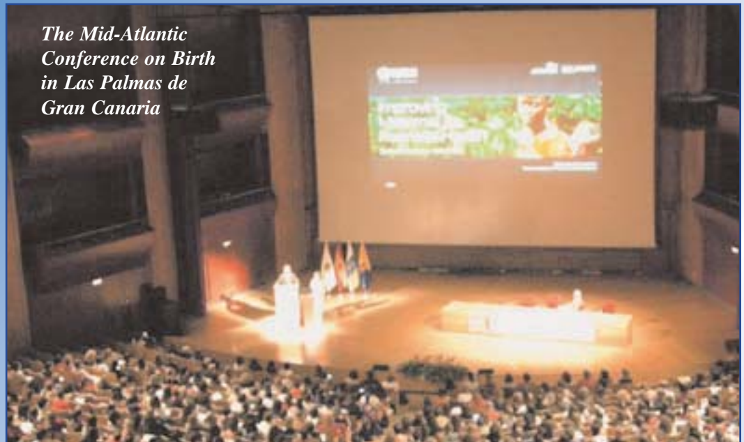
The Mid-Atlantic Conference on Birth in Las Palmas de Gran Canaria

mother-baby connection. Also present were gynecologists, pediatricians, scientists and researchers, coming together and recognizing the value of women's role in the sacred event of childbirth.